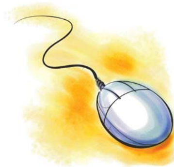
ADVENT GOES GREEN!